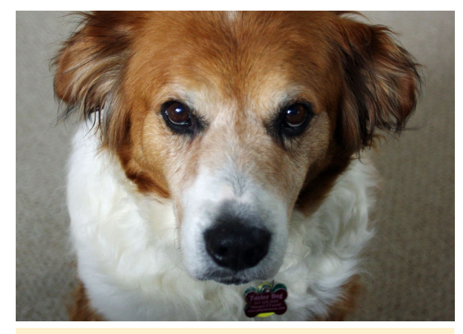
Lady Bug, Young At Heart Pet Rescue, Illinois Helped by a senior dog grant from the Grey Muzzle Organization.

Maybe you adopted an older dog, maybe you've had him or her since puppy days. Either way, keeping him healthy and happy for as long as possible is what we all strive toward.