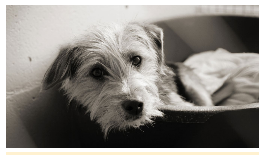
Orthopedic senior dog beds donated to shelters nationwide by The Grey Muzzle Organization.

You may notice your old friend doesn't respond to you like he used to. Hearing loss is very common as dogs age and he may not realize you're calling him. Be sure to keep him on leash or within your sight if you take him to the park, on an easy hike, or even on your own property.